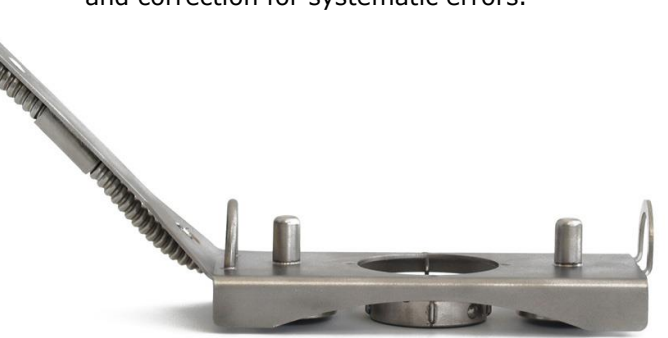
Figure 3 HF01 with frame with magnets

HF01 is most suitable for relative measurements using one sensor, i.e. monitoring of trends relative to a certain reference point in time or comparing heat flux at one location to the heat flux at another location. If the user wants to perform accurate absolute measurements with HF01, as opposed to relative measurements, the user must make his own uncertainty evaluation and correction for systematic errors.