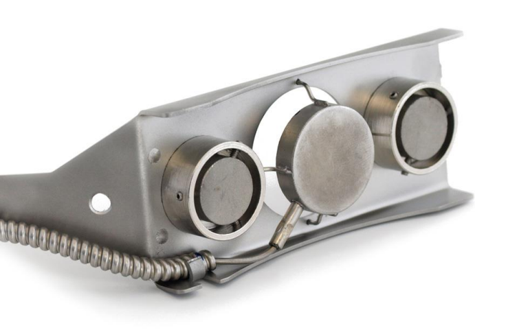
Figure 1 HF01 with frame with magnets

HF01 high temperature heat flux sensor measures heat flux and surface temperature at high temperatures, typically in industrial environments. It is particularly suitable for trend-monitoring and comparative testing. The same technology can be used to manufacture heat flux sensors for different applications.