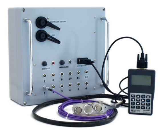
Figure 4 the ALUSYS measuring system, for trend - monitoring and comparative surveys of heat fluxes and surface temperature on industrial installations. Connected is one HF01 sensor, as well as the Keyboard Display.

trend-monitoring and comparative measurement of heat flux and surface temperature in industrial installations.