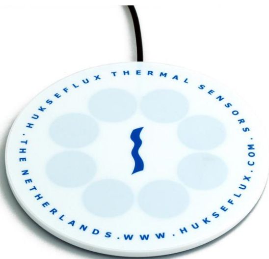
Figure 1 HFP03 ultra sensitive heat flux plate

HFP03 is an ultra sensitive sensor for measurement of small heat fluxes in the soil as well as through walls and building envelopes. The total thermal resistance is kept small by using a ceramics-plastic composite body. See also model HFP01: putting several HFP01 sensors electrically in series is an alternative for using HFP03.