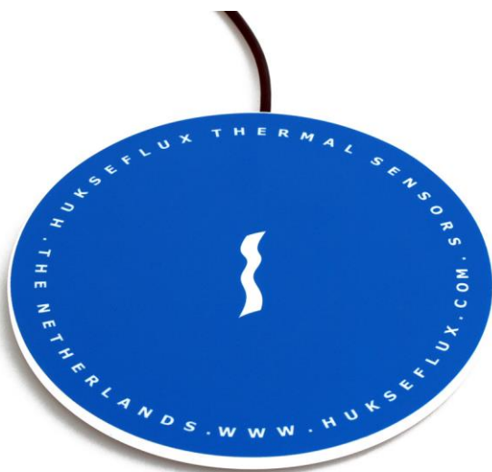
Figure 2 opposite side of HFP03, which has a blue coloured cover