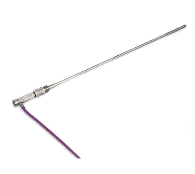
Figure 1 NF01, standard 8 x 10<sup>-3</sup> m diameter model, with screwed coupling

NF01 is used for monitoring heat flux and temperature in high temperature environments, typically in walls and shells of blast furnaces and smelters. Measuring heat flux as well as temperature with one sensor is more accurate and practical than using distributed temperature measurements. The same technology is used to manufacture heat flux sensors for different applications.