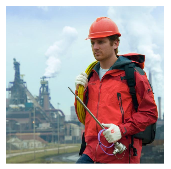
Figure 2 NF01: special design with positioning piece and connection head