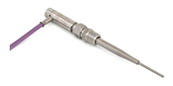
Figure 3 NF01, optional 4 x 10^{-3} m diameter model, with screwed coupling