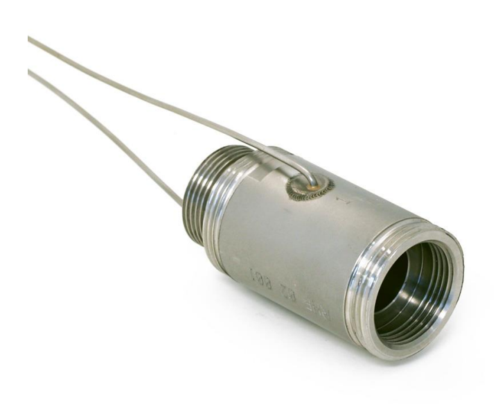
Figure 0.1 Example of a customer-specific RHF ring heat flux sensor with 2 x heat flux and temperature sensor, also showing high temperature cables

RHF is most suitable for relative measurements using one sensor, i.e. monitoring of trends relative to a certain reference point in time or comparing heat flux at one location to the heat flux at another location. The heat flux sensor calibration depends on the way the sensors are built-in and may also depend on the flow rate of the gas or liquid used for cooling. RHF01 is provided with a factory calibration of every sensor which is suitable for relative measurements. If you want to perform accurate absolute measurements with RHF, as opposed to relative measurements, it is necessary to calibrate the RHF incorporated in the final design under operating conditions, possibly as a function of water or air flow. Hukseflux can provide dedicated heaters to perform such calibration.