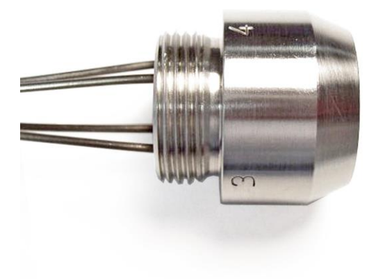
Figure 0.2 Example of a customer-specific RHF01 ring heat flux sensor with 4 x heat flux and temperature sensor