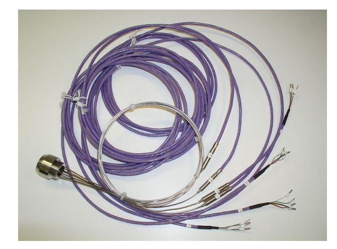
Figure 0.3 Example of a customer-specific RHF ring heat flux sensor; the entire sensor, high temperature cable and low temperature extension cable